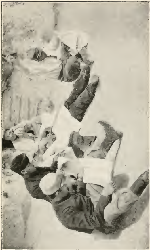
AMERICANS IN THE FOREIGN LEGION RECEIVING NEWS FROM HOME